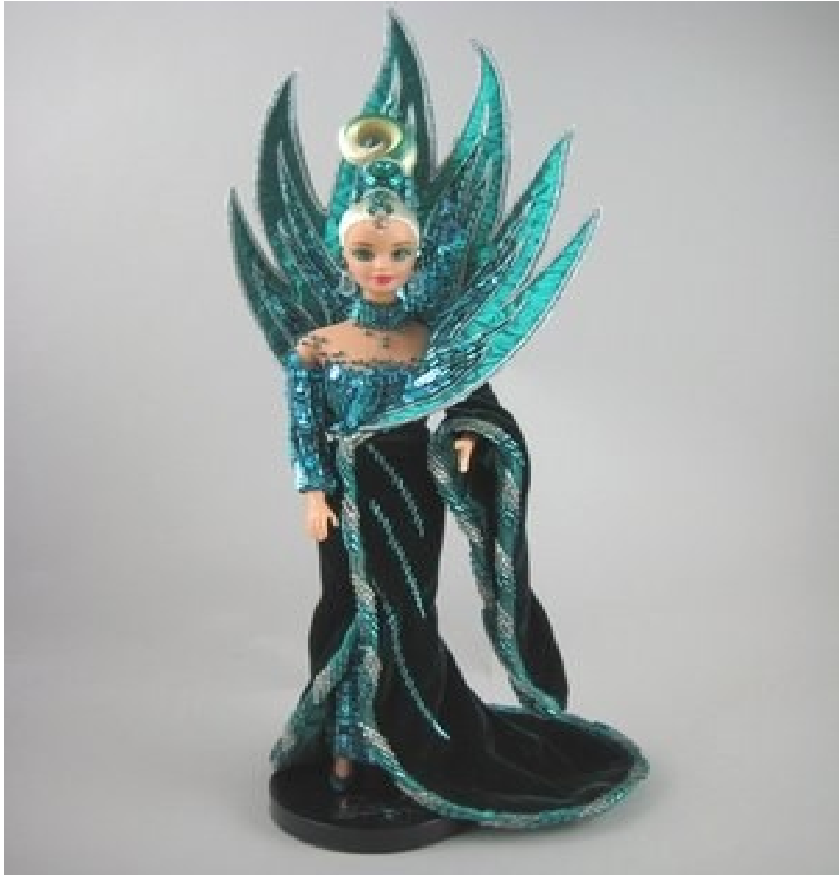
299: BOB MACKIE NEPTUNE FANTASY BARBIE