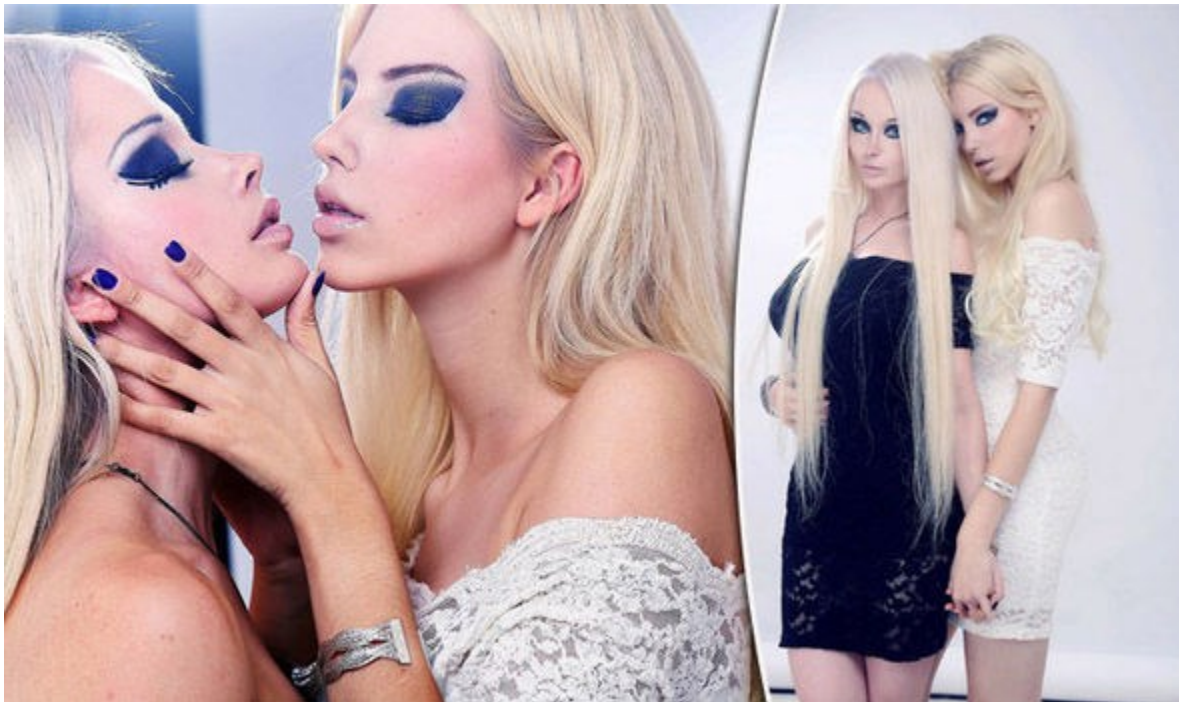
The 'human Barbie' has been pictured in a sexy shoot with her model friend

'Human Barbie' Valeria Lukyanova puckers up for sexy shoot with blonde doppelgänger model 15