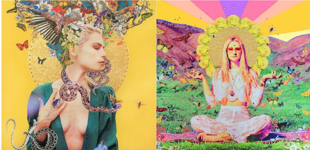
ENLIGHTENMENT BARBIE - A NEW MYTHOLOGY FOR THE ICONIC MODERN WOMAN

These false leaders will have supernatural power motivated by Satan, [Shall show great signs and wonders]. That is, shall pretend to work miracles. They will so nearly resemble prophets in their miraculous power as to render it difficult to detect the imposture. The historian, Josephus represents the false Christ’s and prophets that appeared as "magicians and sorcerers." He says they led the people out into the deserts, and promised to work miracles to deliver them. 3